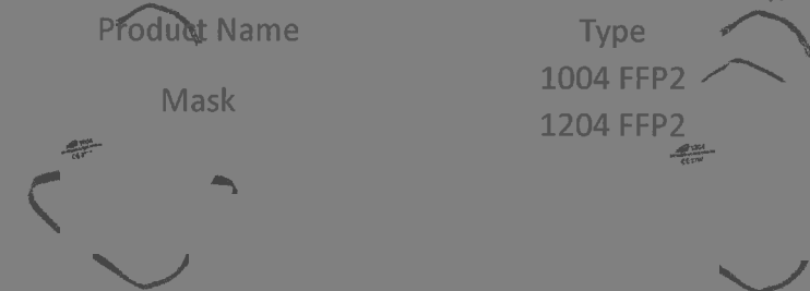
Mask 1004 FFP2

4. Detailed description of the PPE to allow traceability/identification of the PPE.